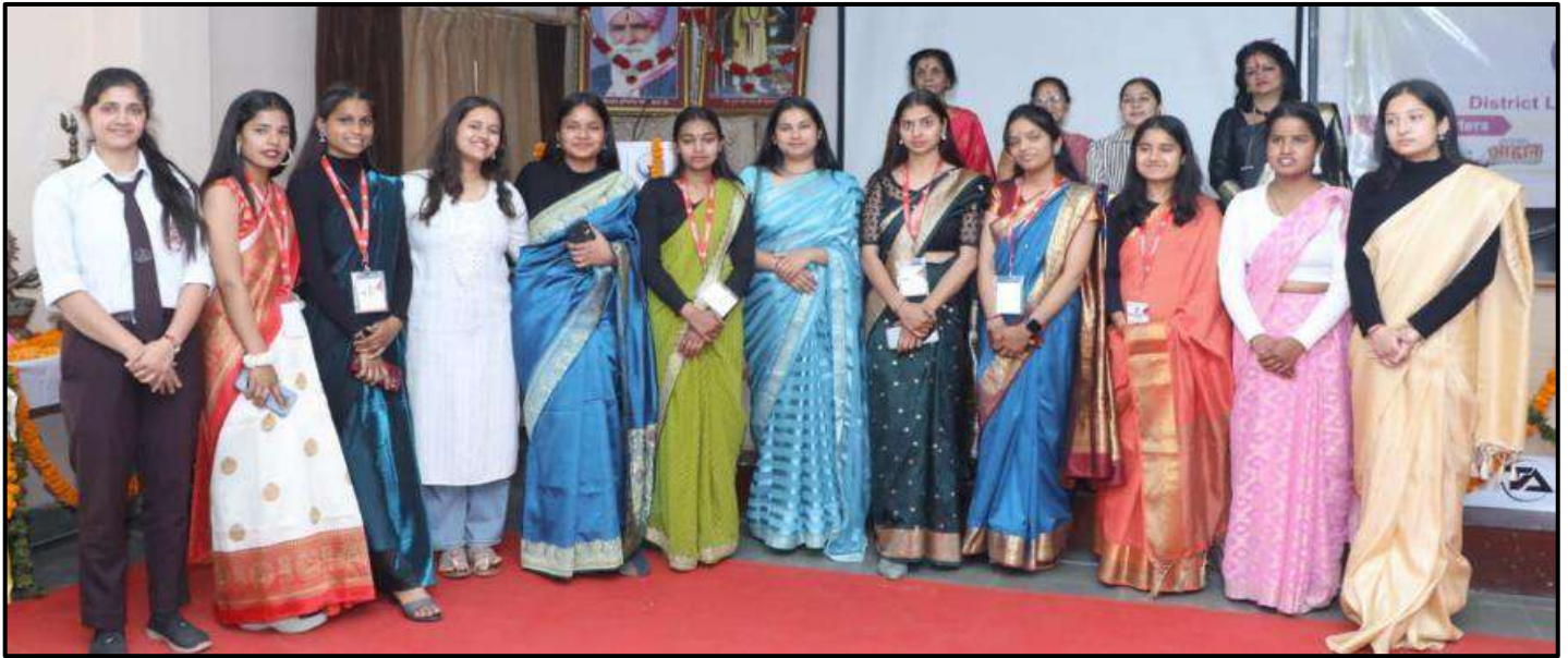
Shakti Vandan – The Women Empowerment Wing of Sakha Trust