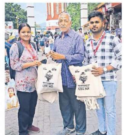
पर्यावरण संरक्षण को लेकर चलाए जा रहे अभियान में शहर के बुजुर्गों भी शामिल हुए और उन्होंने इस प्रयास की सराहना की। साथ ही अन्य लोगों को भी पर्यावरण के मुद्दे पर जागरूक करने की बात कही