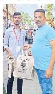
'साखा ट्रस्ट' के युवा सदस्यों ने देहरादून शहर के विभिन्न बाजार में ईको फ्रेंडली बैग बाँटकर लोगों को पर्यावरण को संरक्षित करने को लेकर जागरूक भी किया