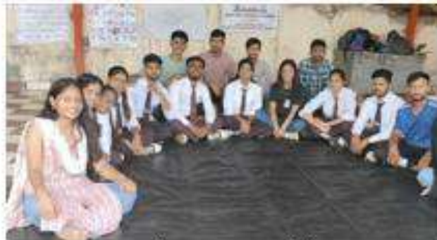
12 September 2024, Foundation Day

🌱 "It didn't begin with an idea, it didn't begin with a banner. It didn't begin with a budget.