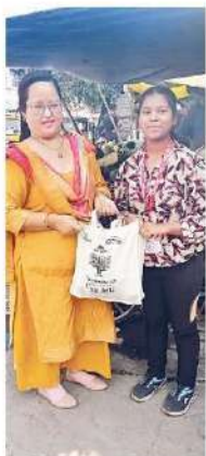
'साखा ट्रस्ट' के युवा सदस्यों ने देहरादून शहर के विभिन्न बाजार में ईको फ्रेंडली बैग बाँटकर दैनिक जागरण की पर्यावरण को संरक्षित करने की मुहिम में अपना योगदान दिया

देहरादून। साखा क्लब और श्री गुरु राम राय महाविद्यालय की राष्ट्रीय सेवा योजना (NSS) इकाई द्वारा जिला स्तर पर आयोजित शक्ति वंदन महिला संभाषण प्रतियोगिता का आयोजन सफलता पूर्वक संपन्न हुआ। उत्तराखंड की रजत जयंती वर्ष के अवसर पर आयोजित इस प्रतियोगिता का उद्देश्य प्रदेश की उपलब्धियों, संभावनाओं और चुनौतियों पर युवतियों के दृष्टिकोण को मंच प्रदान करना था।