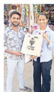
दैनिक जागरण की पर्यावरण को संरक्षित करने की मुहिम में युवाओं ने भी बढ़-बढ़कर हिस्सा लिया और अपना योगदान देने का संकल्प लिया