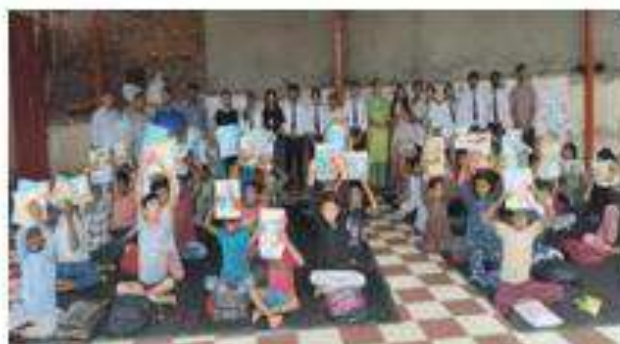
Captured during the 'Likho Apni Kahani' stationery distribution drive by Sakha Trust.

🤝 Sakha Trust – Born from Friendship, Grown with Purpose